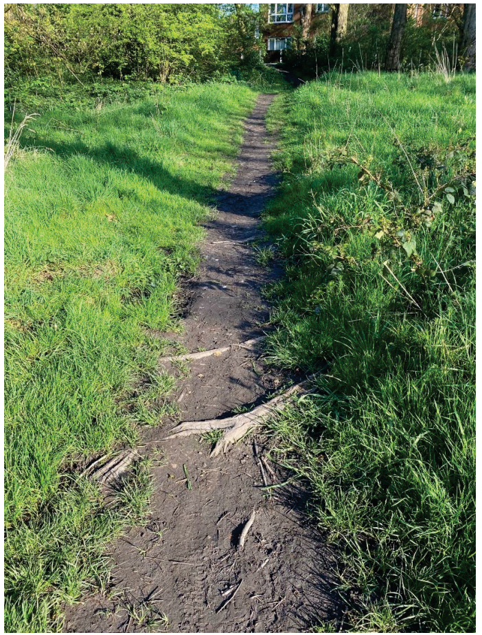
Photo of path to be formalised with compacted aggregate. Tree roots to be retained and built over.

The path goes through an area of mature trees which have exposed roots showing. The health of the trees is important so is it is proposed to install edging boards and build the path levels up over the tree roots and carry out minimal excavation. The edging boards will need to be feathered back into the ground levels using any excavated material and bringing in some additional topsoil.